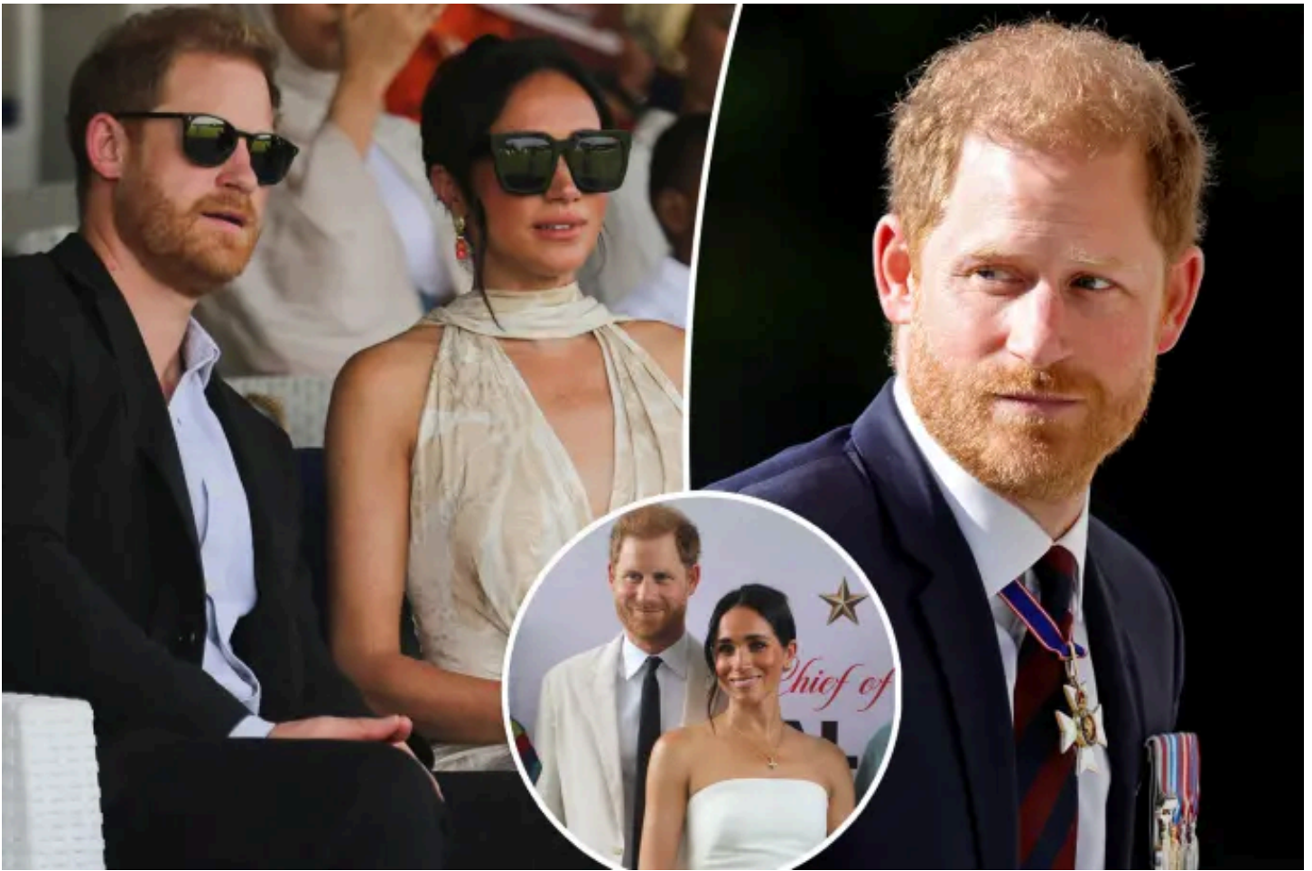
Prince Harry is 'bored' with 'difficult' Meghan Markle, 'never sees' his friends: expert