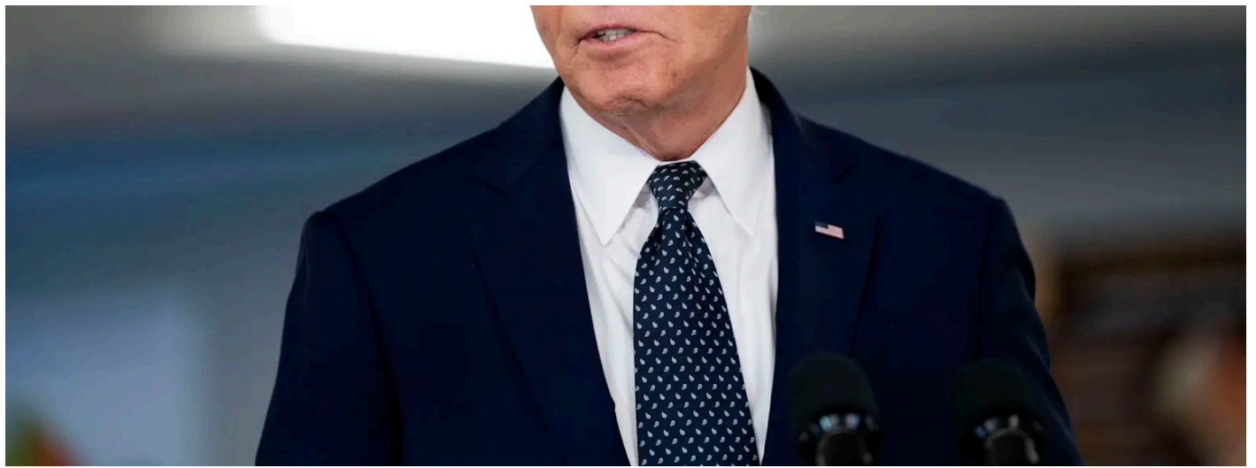
President Joe Biden delivers remarks after receiving an operational briefing on extreme weather at the D.C. Emergency Operations Center in Washington, DC.