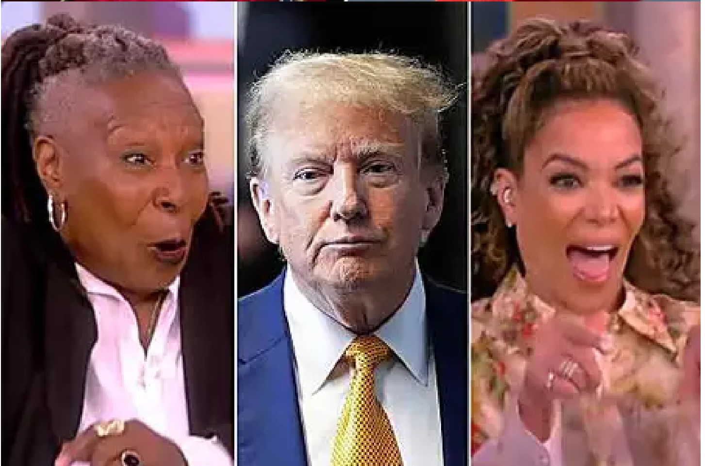
'The View's Whoopi Goldberg And Sunny Hostin Can't Contain Their Glee At The Thought Of...